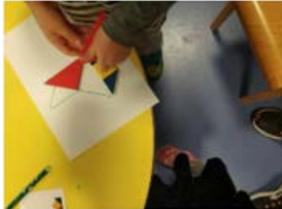
Figure 3. Tangram

front of the paper with crayons, 3. draw the second scene of the story on the back side of the paper, 4. repeat step two, 5. repeat step three. After all four pages are filled in, a new piece of paper is taken in, and all five steps are repeated. The cycle continues until the end of the story. The picture book is made by taping together the folded papers. Furthermore, in thinking by the rules and logical thinking, preschool teachers identify origami and tangram (Fig.3). From geometric figures, new objects are arranged according to the child's interest. The child does not need to follow a series of actions to reach a solution, but by choosing geometric figures he manages to complete the task.