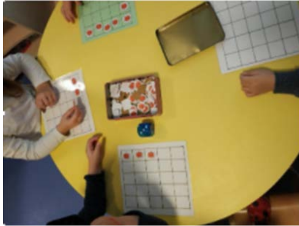
Figure 1. Social game with rules: "Kindergarten Bingo"

Within art activities preschool teachers noticed that defining steps and pattern recognition can be used in art projects, while any story can be represented as an algorithm for easier understanding and interpretation. For example, the description of the project "My vision of nature": Children are sitting in pairs leaning against each other. They have the same colours and the same drawing pad. The instruction is to create the same drawing by arranging each step without looking. Children take turns determining what and where to draw. For example, the first child says "Let's draw a yellow sun in the upper left corner of the paper." After drawing, the other child says, "Let's draw a bird with outstretched wings under the sun." Children draw while they are interested or until the paper is filled out. The drawings are then compared in a way to determine similarities and differences, and one can analyze why the differences occurred. In cases of representing stories as an algorithm children can draw, tell or express story as a set of events described in specific order.