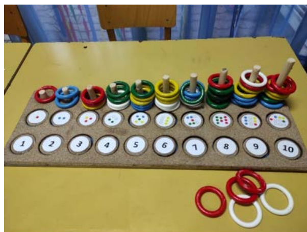
Figure 4. Pre-mathematical game "Point, number, ring"